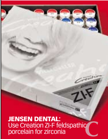
JENSEN DENTAL: Use Creation ZI-F feldspathic porcelain for zirconia