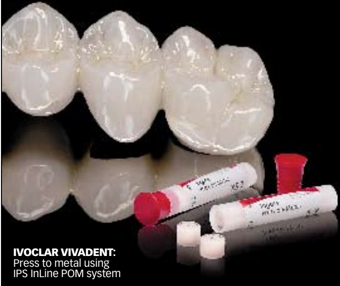
IVOCLAR VIVADENT: Press to metal using IPS InLine POM system